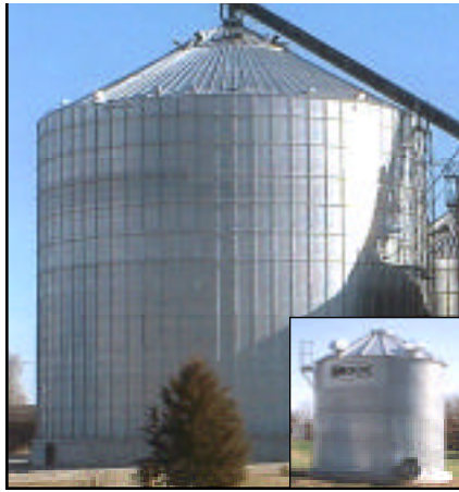
BIG & SMALL 680,000 bu. capacity 3,250 bu. capacity